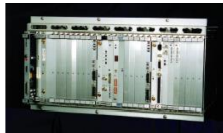
VME avionics chassis